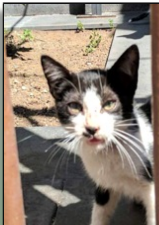
Kitten awaits rescue

My eyes have been opened to the shadowy side of Sicily! Back in 2002 while staying on the island, I found this badly wounded cat. I managed to find a vet, who restored her back to health and I was delighted to be able to take her back to her colony. Imagine my horror, when a few months later, I learned Lizzie and her family had all been poisoned.