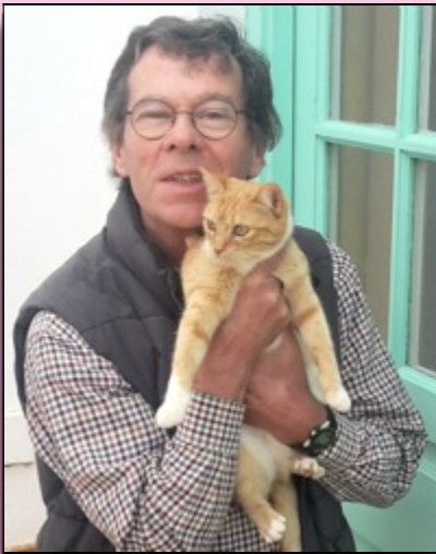
Little Cinny - 7 nights on our bed!

We fell in love with a little cinnamon female, maybe 9 months old, who was hanging around our chalet the first night. She scampered in, we picked her up, cuddled her and she spent the next seven nights snuggled up and purring on our bed! We must have put a month's food in her during that period! We christened her Cinny , though she has probably been christened a dozen times by other benefactors!